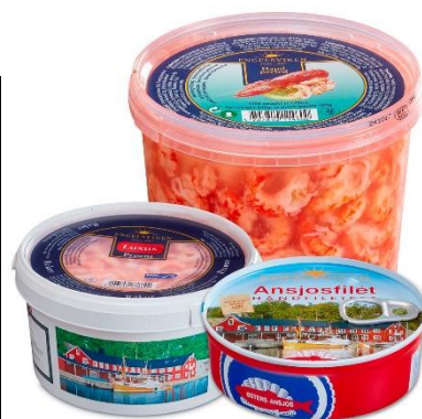
ECD shrimp products and canned goods sold in Nordic supermarkets